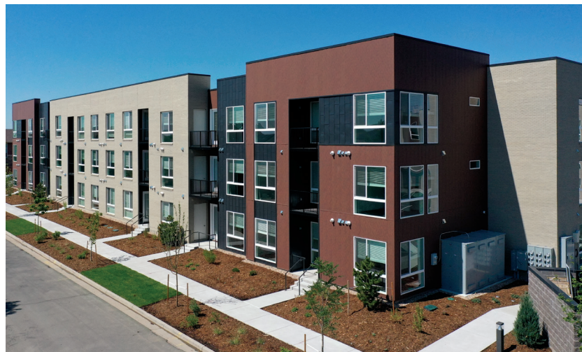
Pictured Left to Right: Central Park Urban Living 3 using Berridge FW-12 Panel, Vee-Panel, and S-Deck in Black Matte, Dark Bronze, and Honey Walnut; Acoya Cherry Creek using Berridge HS-8 Panel in Terra-Cotta, Zinc-Grey, and Charcoal Grey; Erie Police Station using Berridge Zee-Lock Panel in Charcoal Grey; Aurora Highlands P-8 School using Berridge HR-16 Panel and FW-12 Panel in Antique Copper Cote and Charcoal Grey; Chappelow Arts Magnet School using Berridge FW-12 Panel in Dark Bronze; Central Park Urban Living using Berridge L-Panel in COR-TEN AZP® Raw