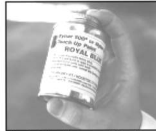
Fig. 2: Select the correct Berridge Touch-Up Paint to match roof panel or trim.