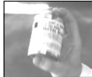
Fig. 2: Shake paint can thoroughly for at least 2 minutes to insure accurate color match.