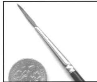
Fig. 1: Use an “Artist’s Brush” with a fine “Liner” point.

Note: Berridge Touch-Up Paint is not recommended for large areas. Consult Berridge for paint specifications and application instructions for touch-up of areas larger than scratches.