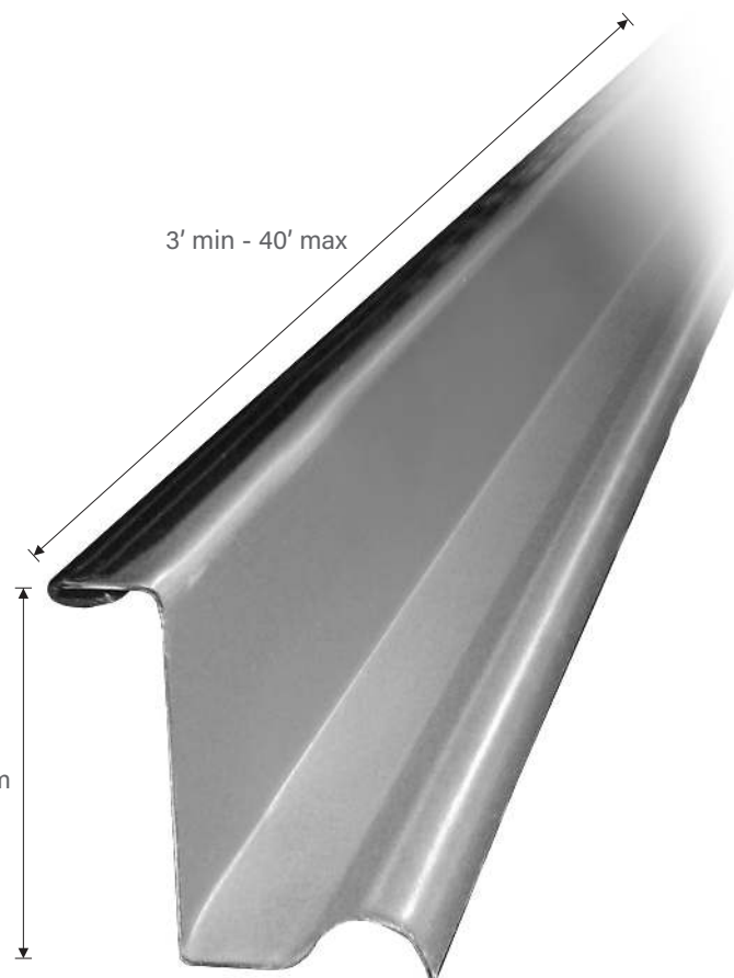
Image shown with Vinyl Weatherseal

** Vinyl weatherseal required for watertightness warranty