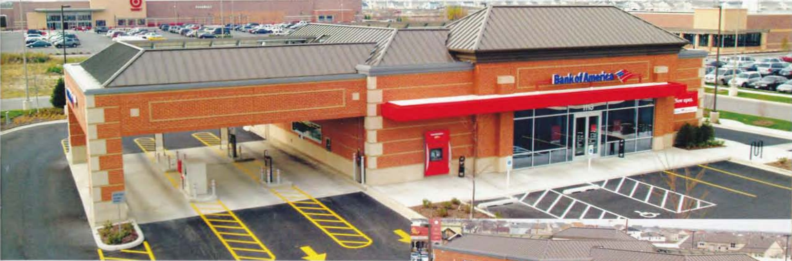
Top & Top Right: BANK OF AMERICA Shorewood, IL

General Contractor: Clune Const., Chicago, IL Architect : Gensler, Chicago, IL Berridge Licensee: Metalmaster Berridge Products: Berridge Cee-Lock Standing Seam Roof Kynar 500 Medium Bronze & Zinc Grey