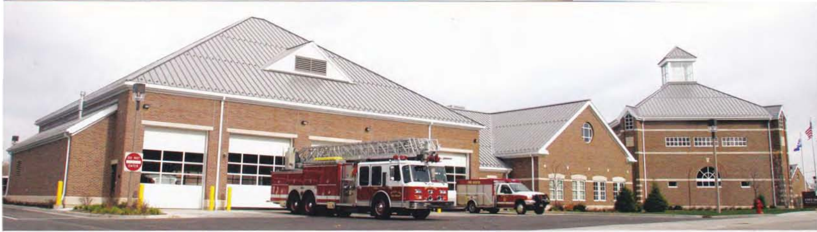
Top: CRYSTAL LAKE MUNICIPAL BUILDING COMPLEX Crystal Lake, IL

General Contractor: A.J. Maggio Company, Mt. Prospect, IL Architect : Larson & Darby Group, Rockford, IL Berridge Licensee: Metalmaster Berridge Products: Berridge Cee-Lock Standing Seam Kynar 500 Zinc Grey & Bone White