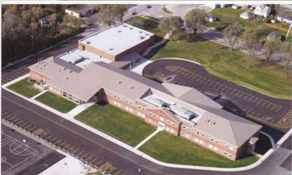
Left Lower: ST. ANNE HIGH SCHOOL St Anne, IL

General Contractor: A.J. Maggio Company, Mt. Prospect, IL Architect - Engineer: Healy Snyder Bender & Assoc, Naperville, IL Berridge Licensee: Metalmaster Berridge Products: Berridge Zee-Lock Standing Seam Kynar 500 Patina Green