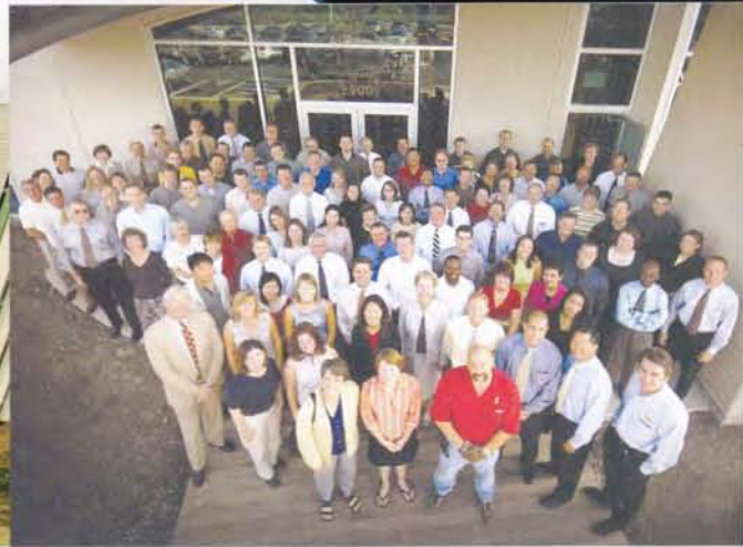
Left: Wight & Company Corporate Offices, Darien, IL; Right: Wight & Company employs more than 155 professionals in its offices in Chicago and Darien, IL and South Bend, IN.