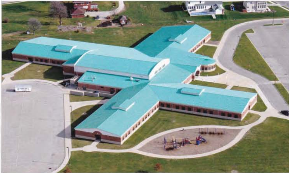
Left Upper: MANTENO ELEMENTARY SCHOOL Manteno, IL

General Contractor: A.J. Maggio Company, Mt. Prospect, IL Architect : Larson & Darby Group, Rockford, IL Berridge Licensee: Metalmaster Berridge Products: Berridge Cee-Lock Standing Seam Kynar 500 Zinc Grey & Bone White