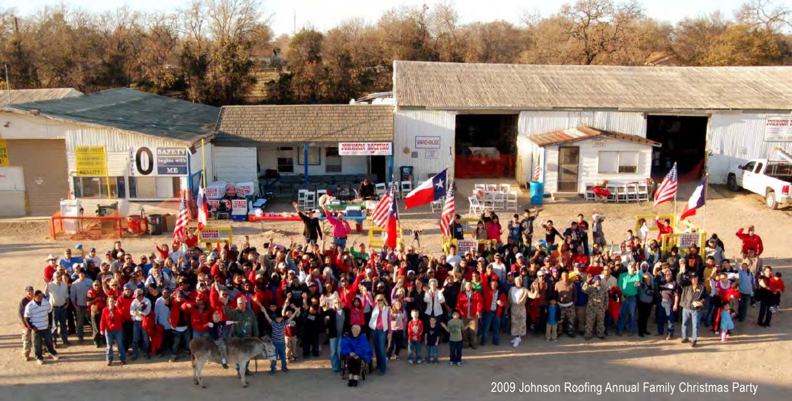
2009 Johnson Roofing Annual Family Christmas Party