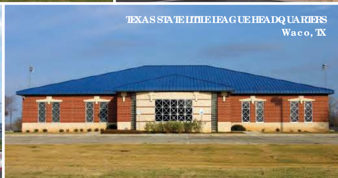
TEXAS STATE LITTLE LEAGUE HEADQUARTERS Waco, TX