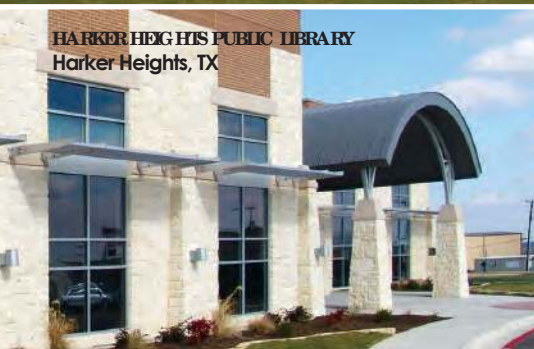
HARKER HEIGHTS PUBLIC LIBRARY Harker Heights, TX