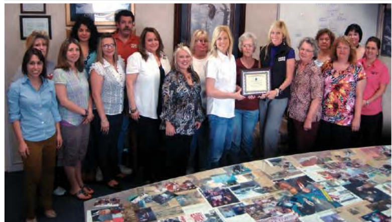
Johnson Roofing Office Personnel with Berridge Customer of Distinction Plaque recognizing exemplary service and sales for 2009.