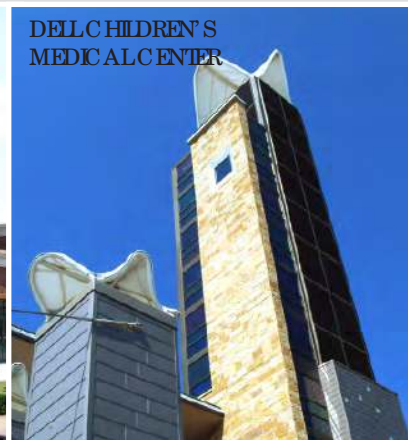
DELL CHILDREN'S MEDICAL CENTER