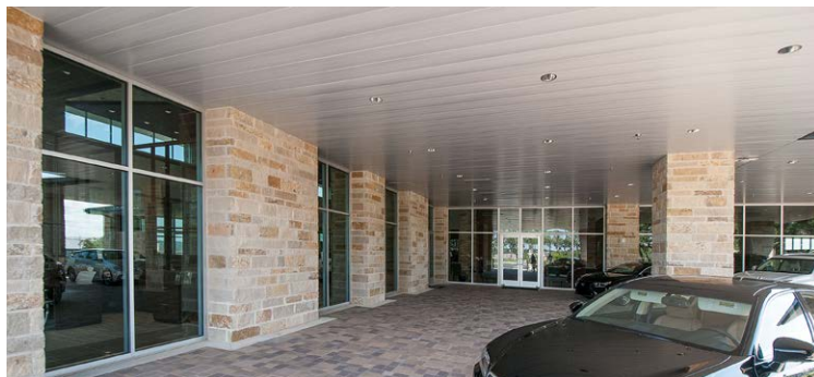
Berridge L-Panel is a great soffit panel and can be site-formed with the FP-16 portable roll former.

Berridge L-Panel can be vented for soffit applications.