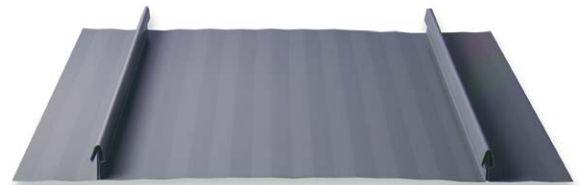
(Shown with Striations which are standard)